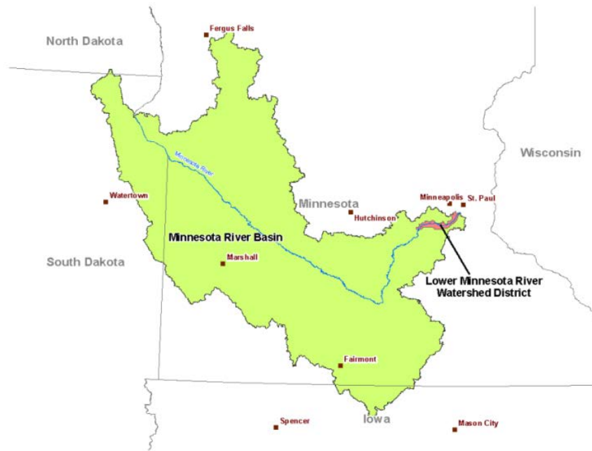
Figure 2-1: Minnesota River Basin Map