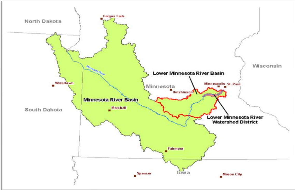
Figure 2-3: Load Comparison from the Lower Minnesota River Basin and External Contributors